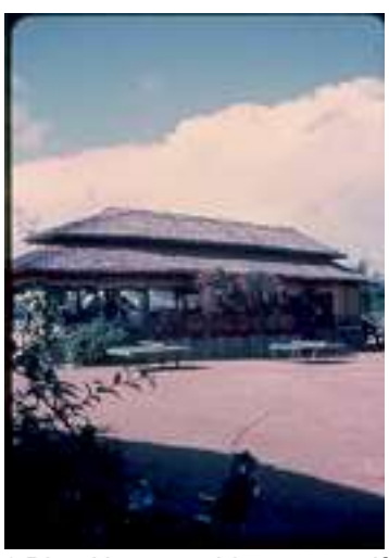
1 Bien Hoa standdown area.tif (131x185)