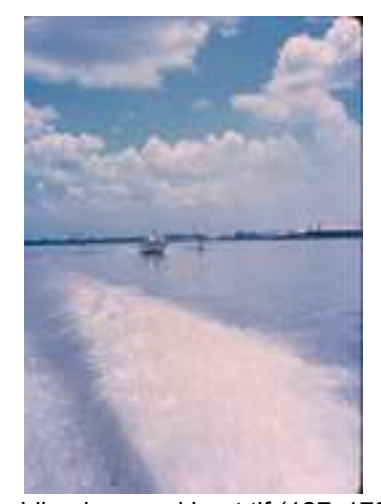
1 riding in speed boat.tif (127x179)