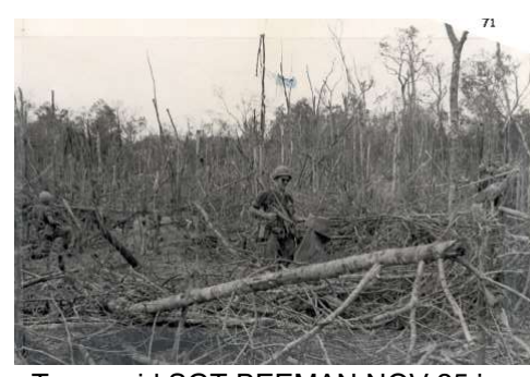
Trapazoid SGT BEEMAN NOV 25.jpg (480x317)