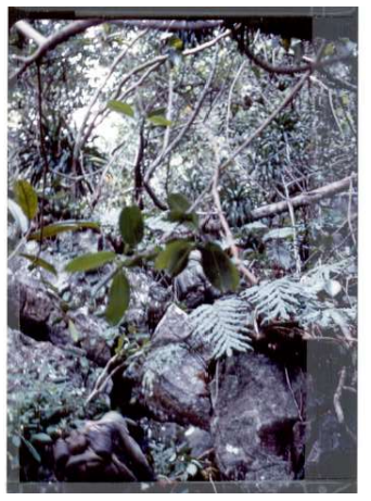
Climbing the saddle of NUI BA DEN Sept'67.jpg | On September 3, 1967, B Company climbed the saddle of Nui Ba Den. We climbed up the saddle about 4 hours, and then went back down. On September 5, 1967, A Company was hit hard by a large VC/NVA element in the same area that B Company started its climb up the saddle. (356x480)