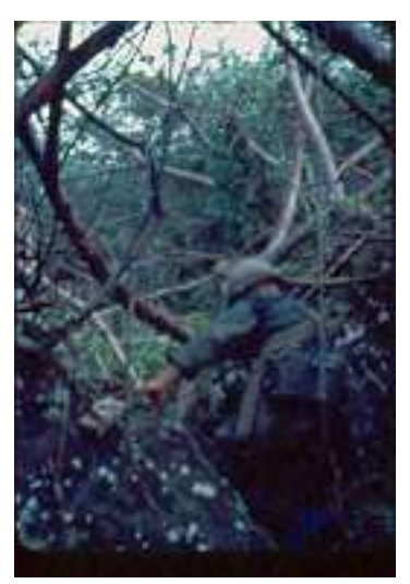
climbing the saddle 3.tif (131x191)