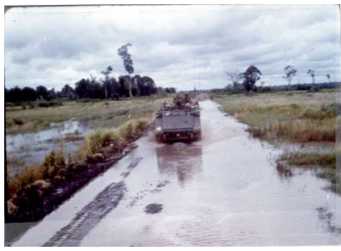
MONSOON ROAD 1.jpg (480x343)