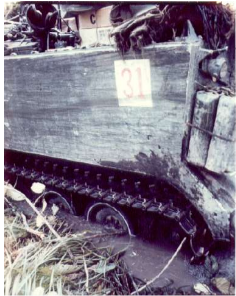
a 3rd PLT B Co, stuck in mud 1.jpg | While making a mounted sweep, the 3rd Platoon got all of four tracks stuck in the mud. Had to get the 1st platoon come and pull us out. (383x480)