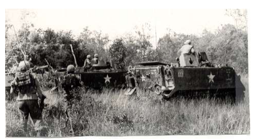
Trapazoid 3RD PLATOON getting ready to move into contact area, Nov 67.jpg | From November 21 to 28, 1967, B and C companies were engaged in fighting in a VC/NVA base camp area in the Trapezoid. (480x257)