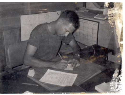
LT FAHEL XO B Co.jpg | Sitting at desk when company XO (431x314)