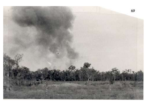
Trapazoid AIR STRIKE THANKSGIVING '67.jpg (480x323)