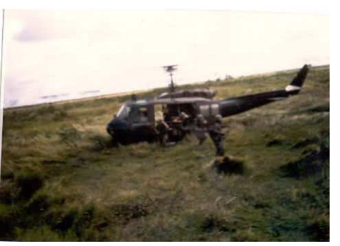
Providing security for LZ 3.jpg (480x338)