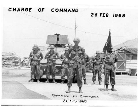
Command Change LT Fahel.jpg (480x356)