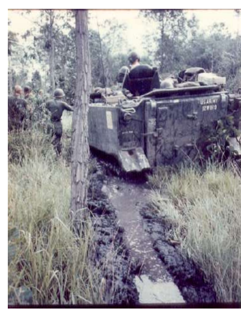
a IN THE MUD 3 .jpg (376x480)