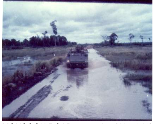
MONSOON ROAD 2 copy.jpg (426x344)