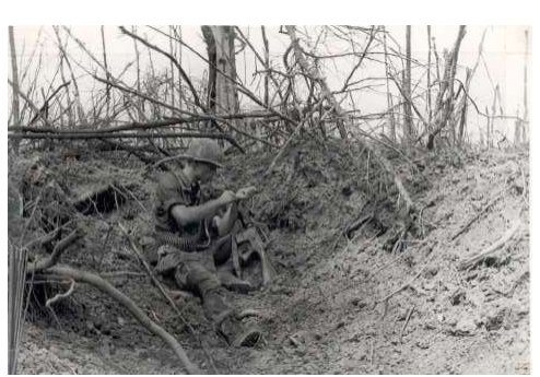
Trapazoid PFC STROUP Nov '67.jpg (480x321)