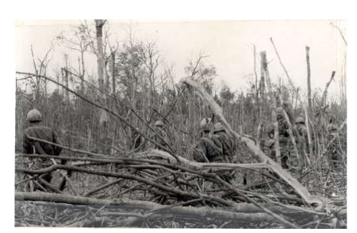
Trapazoid 3RD PLATOON, Nov 24, '67. jpg (480x301)