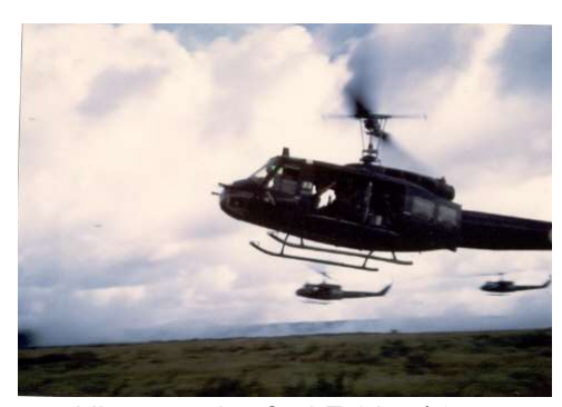
providing securing for LZ 1.jpg | 3 pictures of 3rd platoon providing security on the LZ for 3/22 Inf. (480x336)