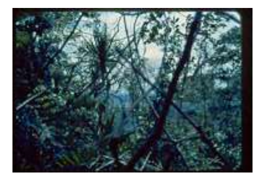
climbing the saddle 1.jpg (195x134)