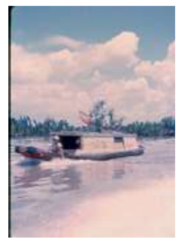
1 Passing sanpan on river.tif (127x176)