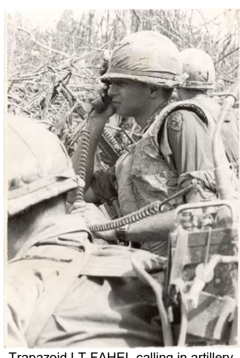
Trapazoid LT FAHEL calling in artillery Nov 22, '67.jpg (335x480)