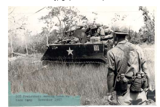
Trapazoid SGT TOM PREISTHOFF, Nov '67.jpg (480x329)