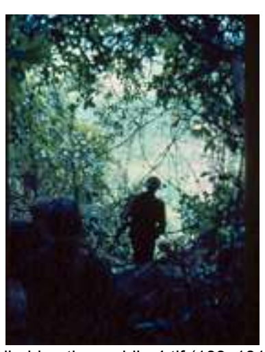
climbing the saddle 4.tif (139x181)