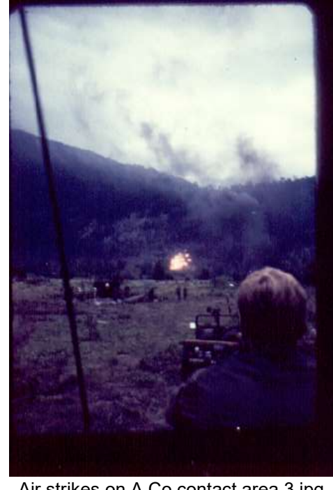
Air strikes on A Co contact area 3.jpg (328x480)