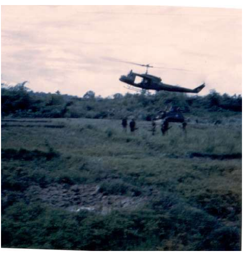
providing security for LZ 2.jpg (473x480)