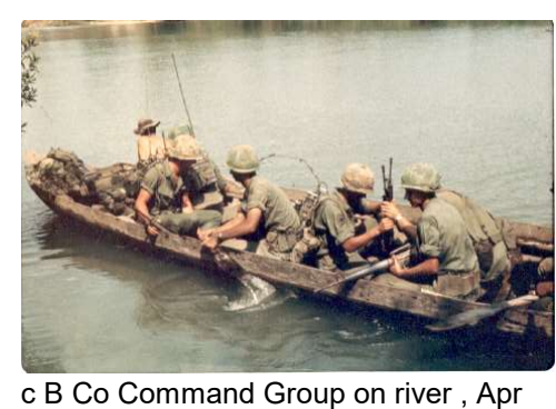
c B Co Command Group on river, Apr '68.jpg | In April '68, after I took command of the company, the BN Command spotted some VC on the river, and directed us to the location. My command group got into a sampan to search the river bank from the river. We found some VC and rice. (480x316)