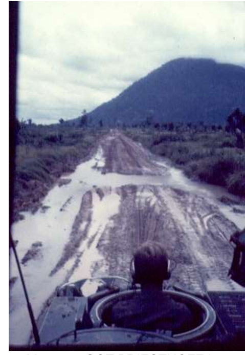
Monsoon SGT PRIESTHOFF.jpg (313x462)