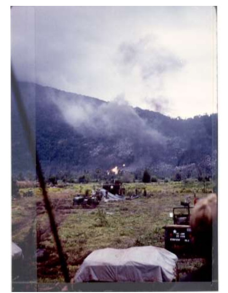
Air strikes on A Co contact area 1.jpg | After the withdraw of A Company from the contact area of September 5, 1967. Air strikes were called in to hit the contact area. (352x480)