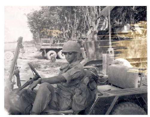
LT FAHEL JEEP.jpg | Sitting in jeep after taking resupply to company when XO (480x366)