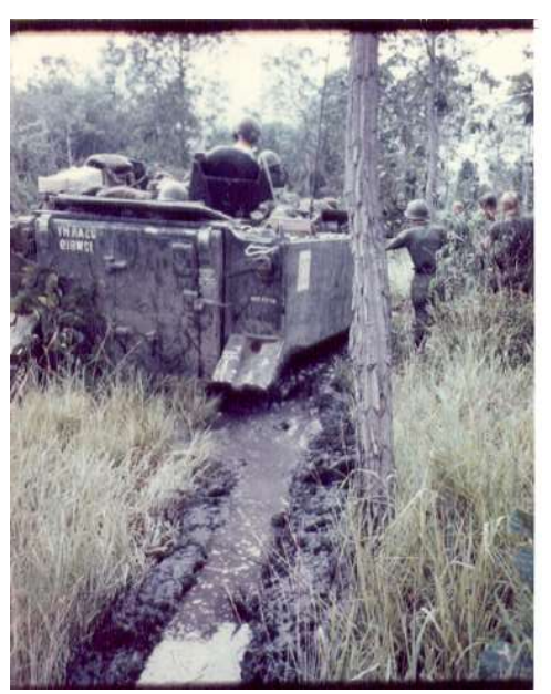
a IN THE MUD 2 .jpg (381x480)