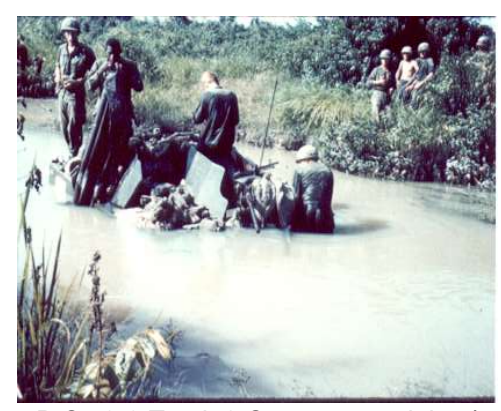
B Co 3-3 Track 2 Oops, we sunk.jpg | The stream was too deep (416x334)