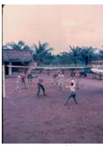
1 Vollyball game.tif (127x173)