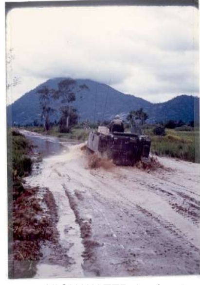
Monsoon HIGH WATER .jpg | 5 pictures of the 3rd platoon on the roads during the monsoon season. This is the road north of Soui Da. (339x480)