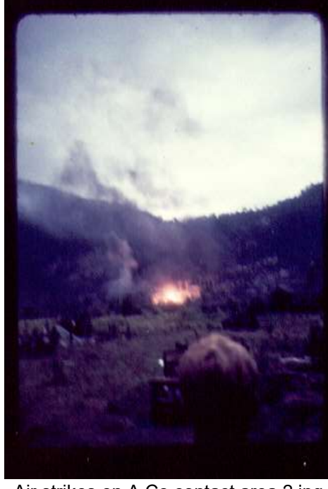
Air strikes on A Co contact area 2.jpg (328x480)