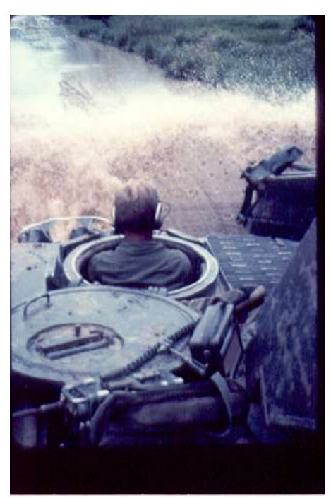
Monsoon MAKING SPASH jpg.jpg (314x480)