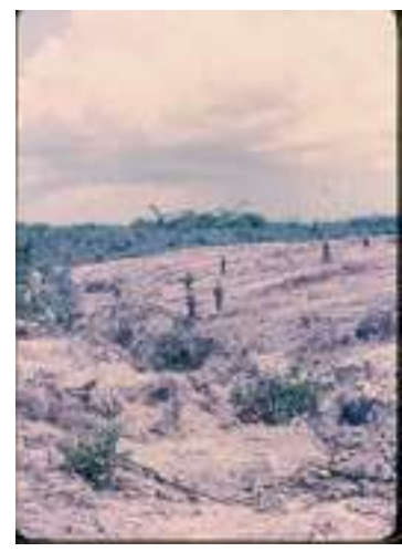
1 area outside Ben Hoa wire.tif (131x181)