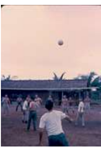
1 volleyball game 2.tif (124x176)