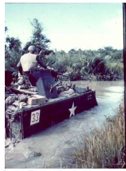
B Co 3-3 Track 1 Fording the stream.jpg | As point platoon for battalion, attempted stream crossing and sunk our 3-3 track.