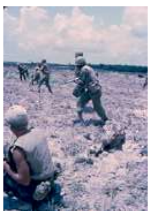
1 3rd platoon sweeping area out side Bien Hua wire.tif | After the 2nd Platoon was ambushed on May 16, 1967, B Company was attached to 3/22 Inf and went to Bien Hoa for area security during the month of June 1967. During that time, the company patrolled around the Bien Hoa base, spent time at the R&R center and took speed boats rides on the river. (126x178)