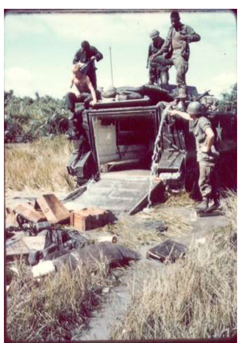
B Co 3-3 track 3 Drying out.jpg | Drying out After. (328x471)