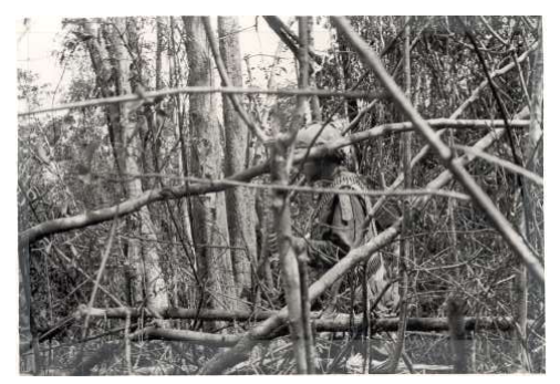
Trapazoid BOMBED OUT AREA, Nov '67.jpg (480x324)