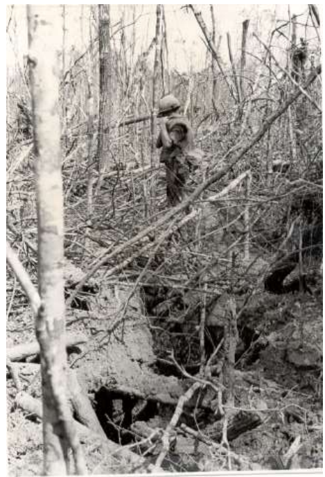
Trapazoid TRENCH, Nov '67jpg.jpg (320x480)