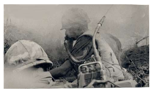
Trapazoid LT FAHEL after artillery round hit, Nov 67 2.jpg (480x278)