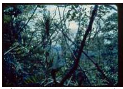
Climbing the saddle 5.jpg (195x134)