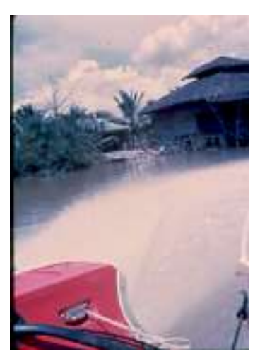
1 Speed boat on Siagon River.tif (127x178)