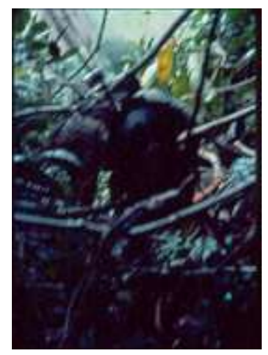
climbing the saddle 2.tif (134x183)