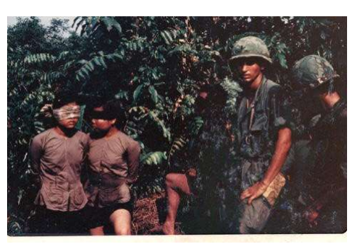
c ON THE RIVER B Co, Apr '68.jpg (480x320)